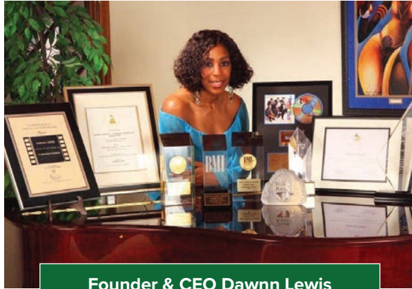
Founder & CEO Dawnn Lewis

As an original member of the TV series A Different World cast, and composer of the show's iconic theme song, Dawnn's popularity and career continues to flourish and has gone on to garner multiple GRAMMY, BMI, ASCAP, NAACP IMAGE, TRUMPET Awards and a variety of Community Service Awards and accolades. She is a TV series creator, Producer, Director, Motivational Speaker, Business Owner and Mentor; currently appearing on the hit NBC series This Is Us! , TNT's Major Crimes & CW's iZombie . Her professional & personal journey combined with her charismatic personality and reputation for integrity in all that she does, has served as a valuable resource to a variety of institutions and corporations, making her a highly sought after spokesperson, performer and speaker.